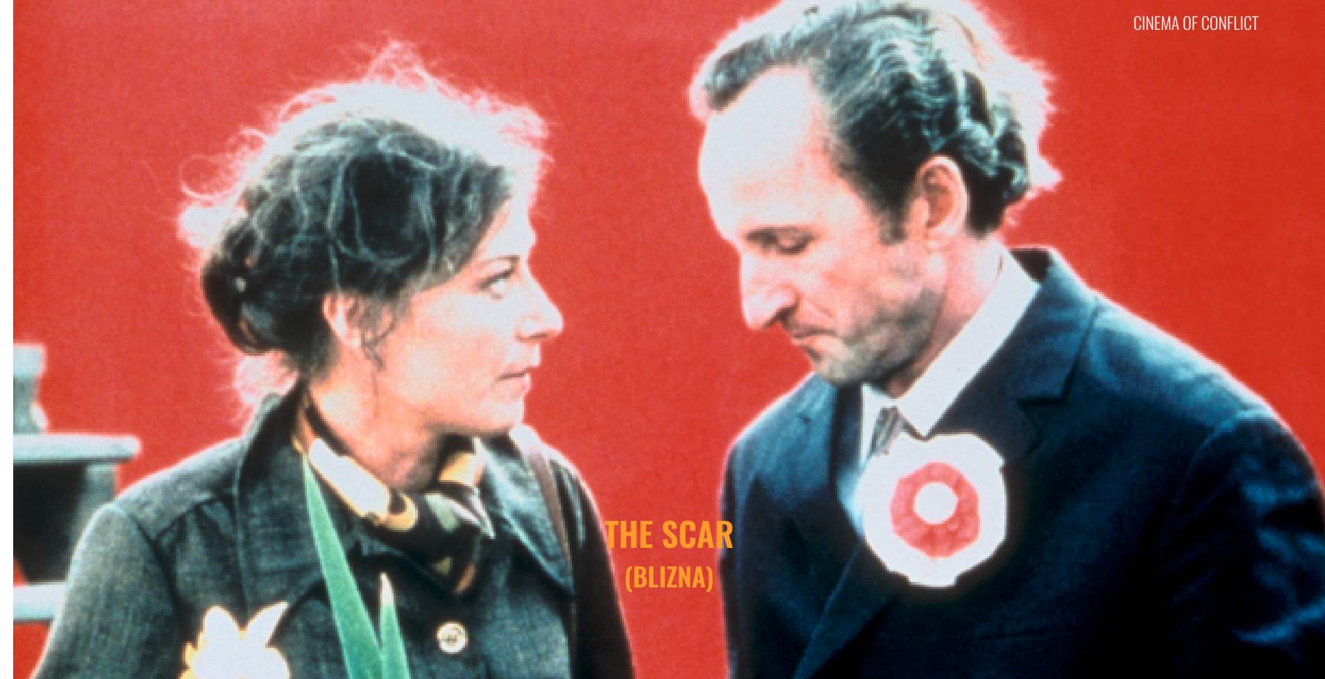
THE SCAR (BLIZNA)

1976 THE SCAR 1979 CAMERA BUFF 1984 BLIND CHANCE 1984 NO END