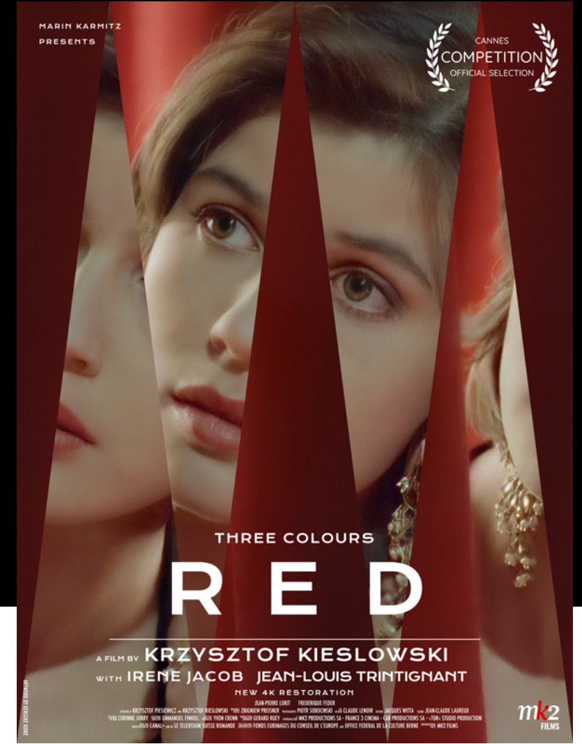
New posters designed by Kenzuke Koike