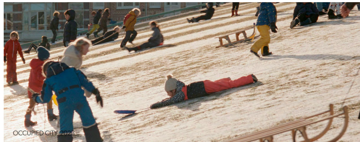
OCCUPIED CITY, 2023