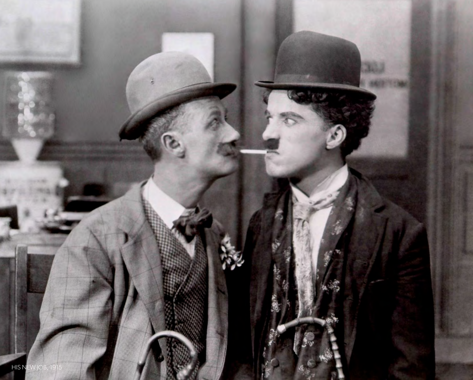
HIS NEW JOB, 1915