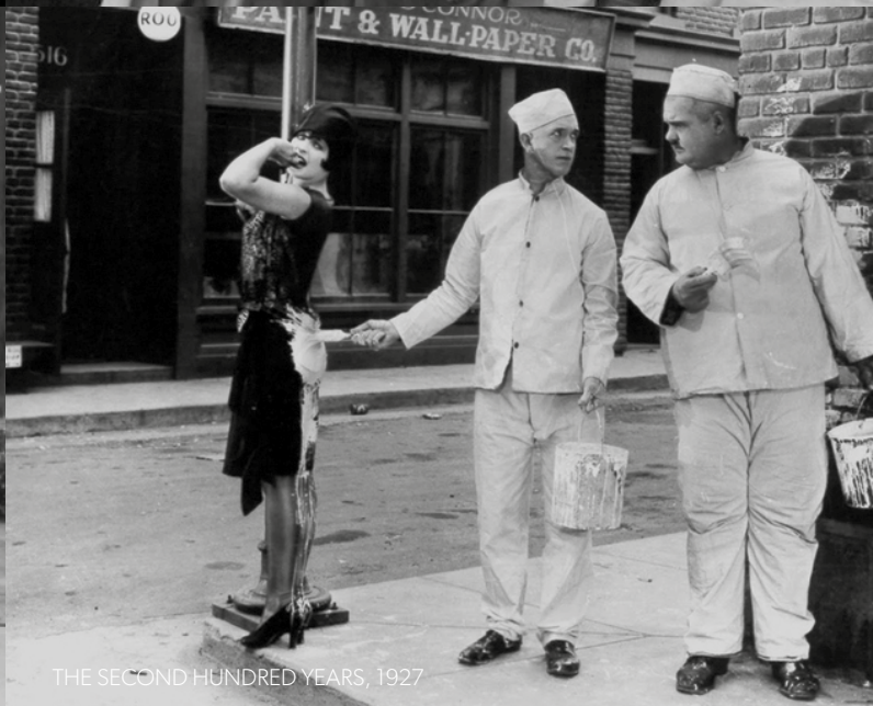
THE SECOND HUNDRED YEARS, 1927