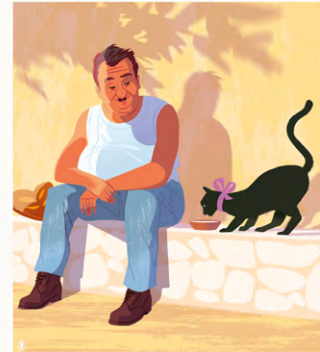
The BAKER'S WIFE