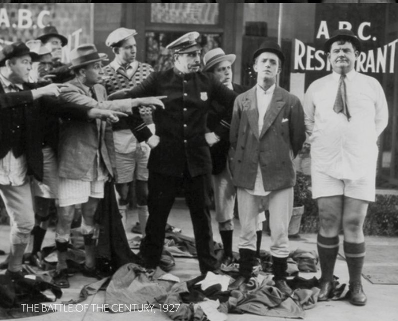
THE BATTLE OF THE CENTURY, 1927