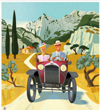
The WELL DIGGER'S DAUGHTER