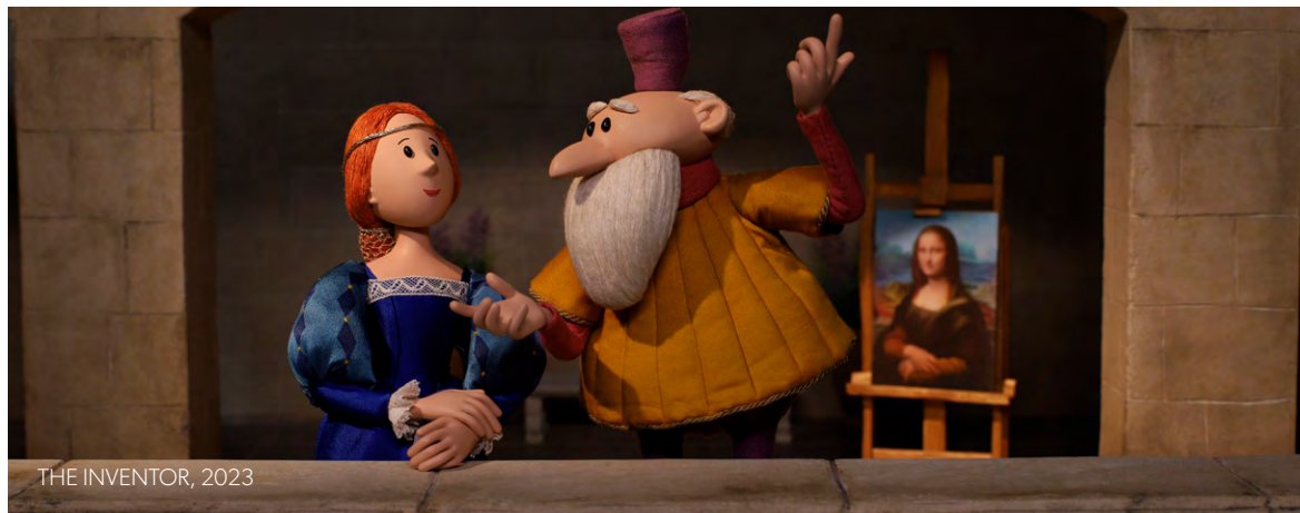
THE INVENTOR, 2023