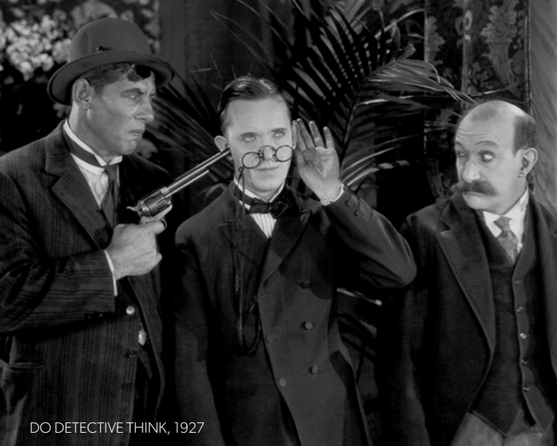
DO DETECTIVE THINK, 1927