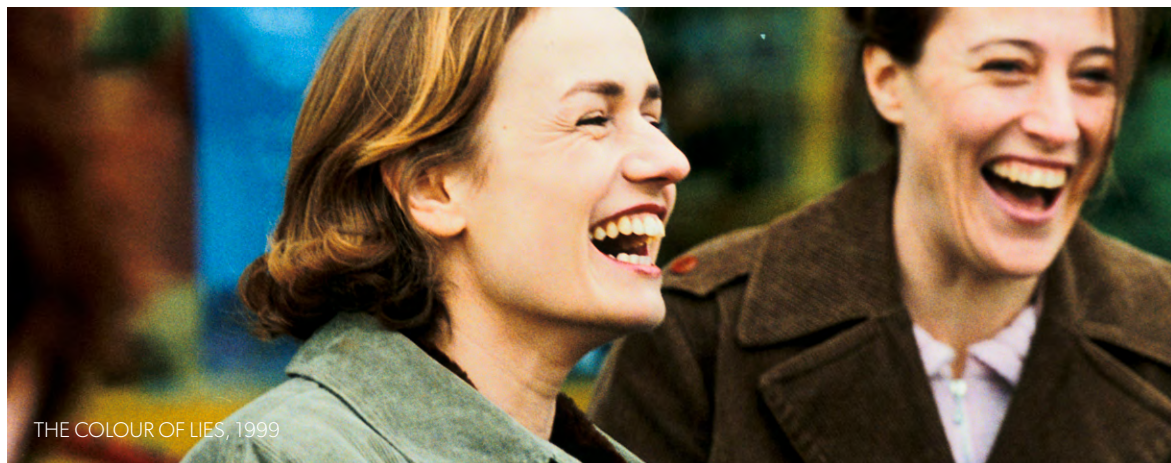
THE COLOUR OF LIES, 1999