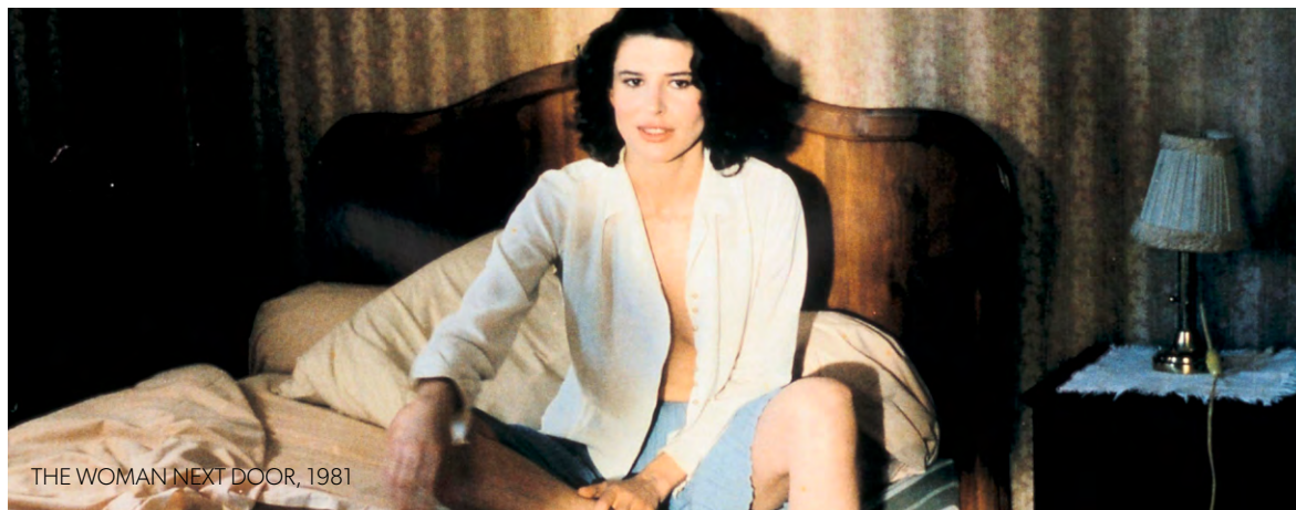
THE WOMAN NEXT DOOR, 1981