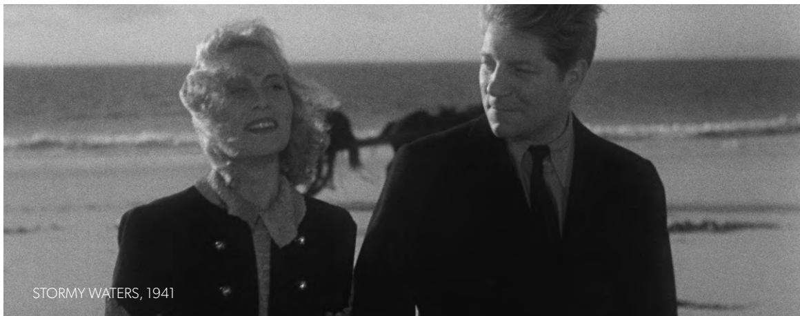
STORMY WATERS, 1941