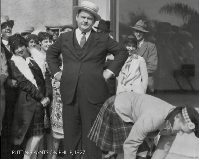
PUTTING PANTS ON PHILIP, 1927