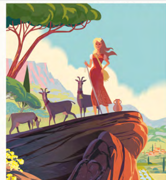
MANON of the SPRINGS