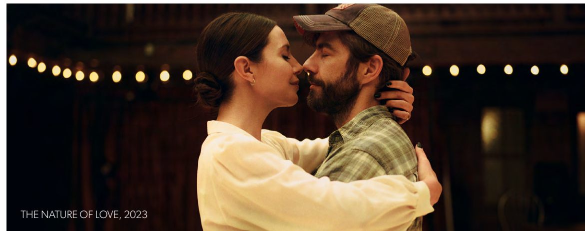
THE NATURE OF LOVE, 2023