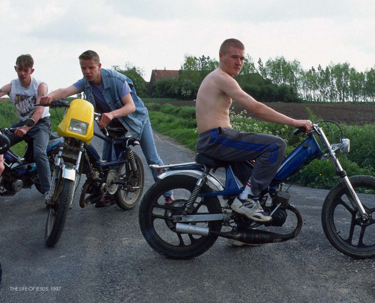
THE LIFE OF JESUS, 1997