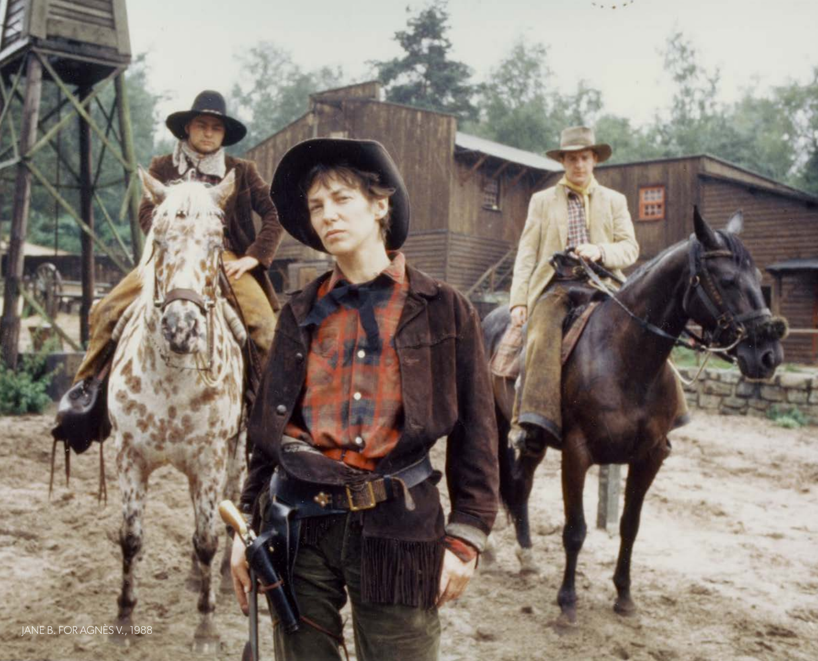
JANE B. FOR AGNÈS V., 1988