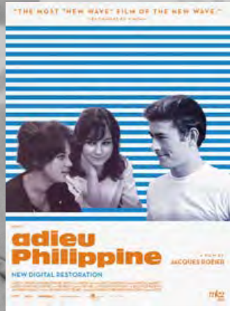
ADIEU PHILIPPINE, 1962