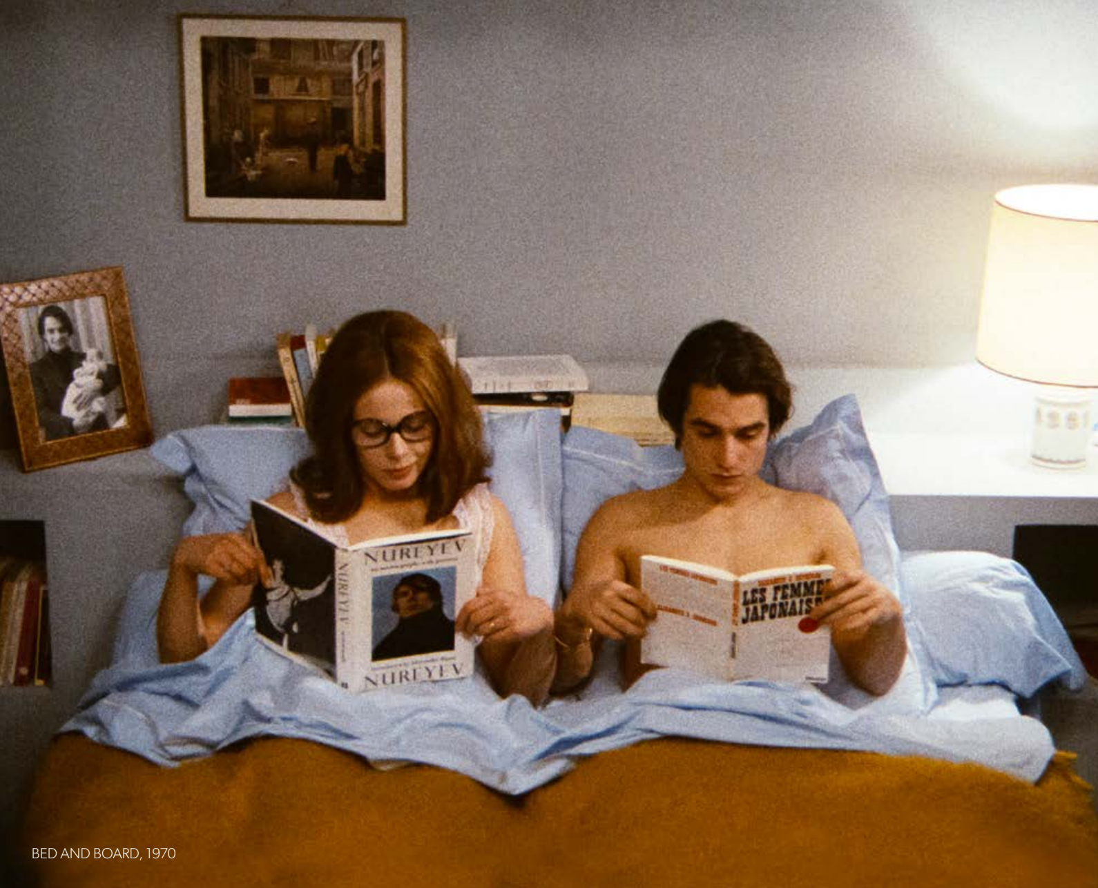
BED AND BOARD, 1970