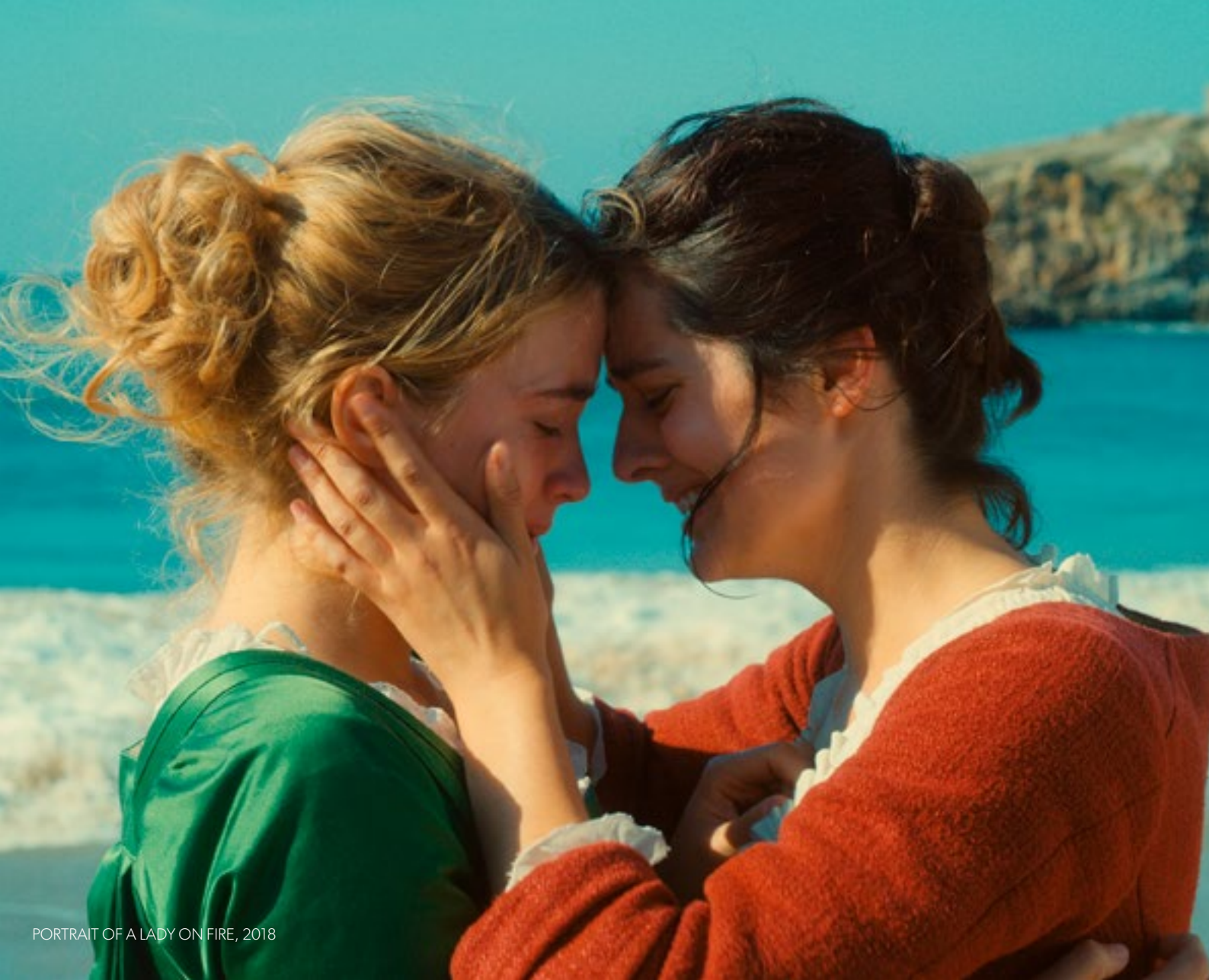
PORTRAIT OF A LADY ON FIRE, 2018