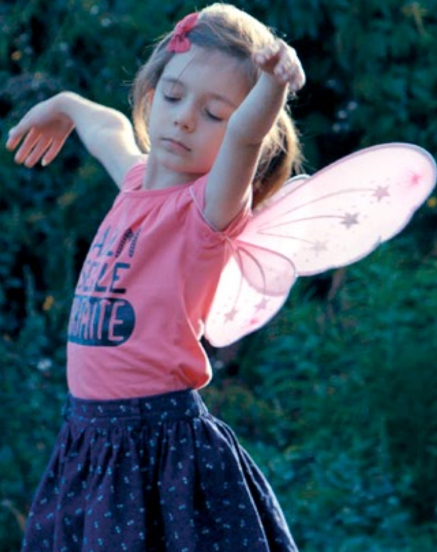
LITTLE GIRL, 2020