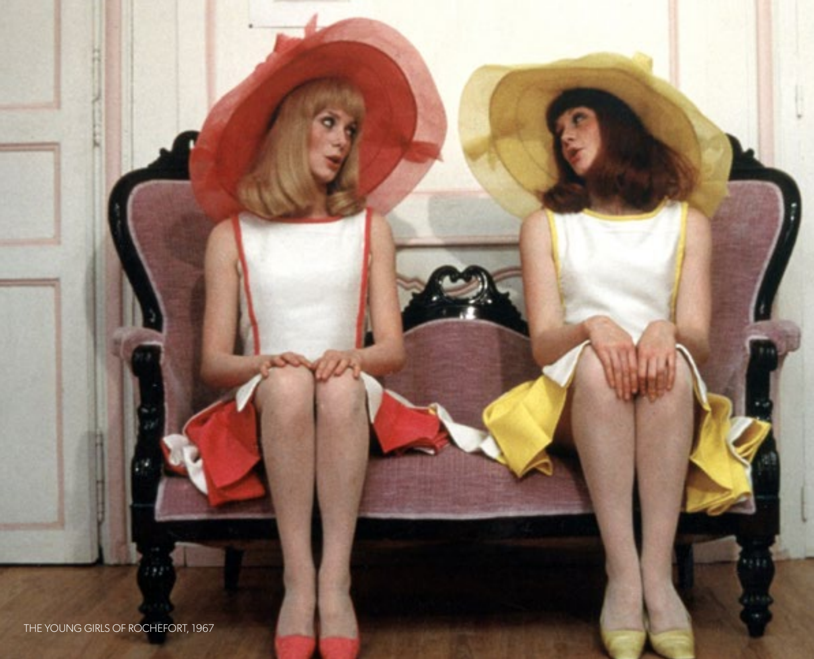
THE YOUNG GIRLS OF ROCHEFORT, 1967