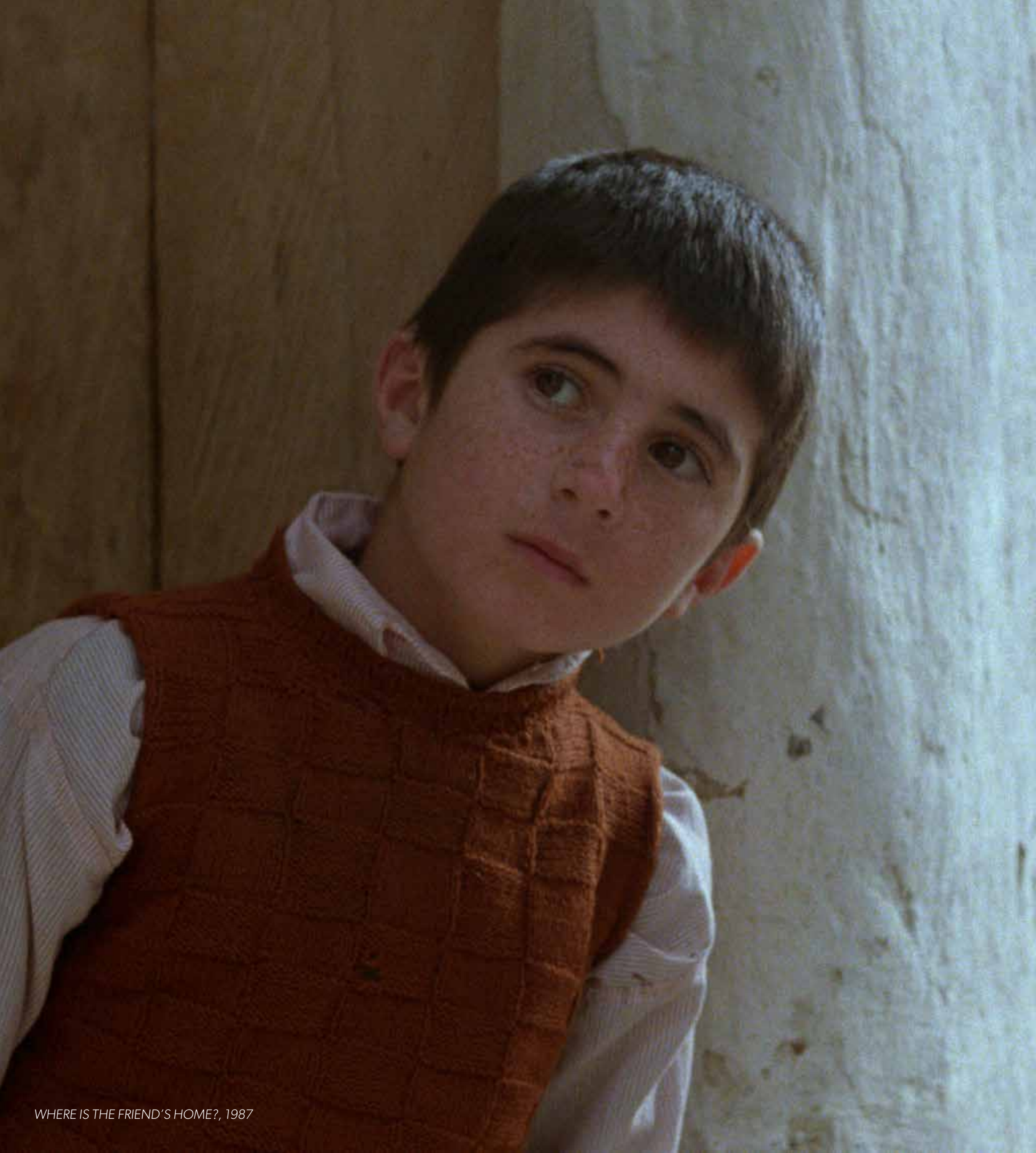
WHERE IS THE FRIEND'S HOME?, 1987