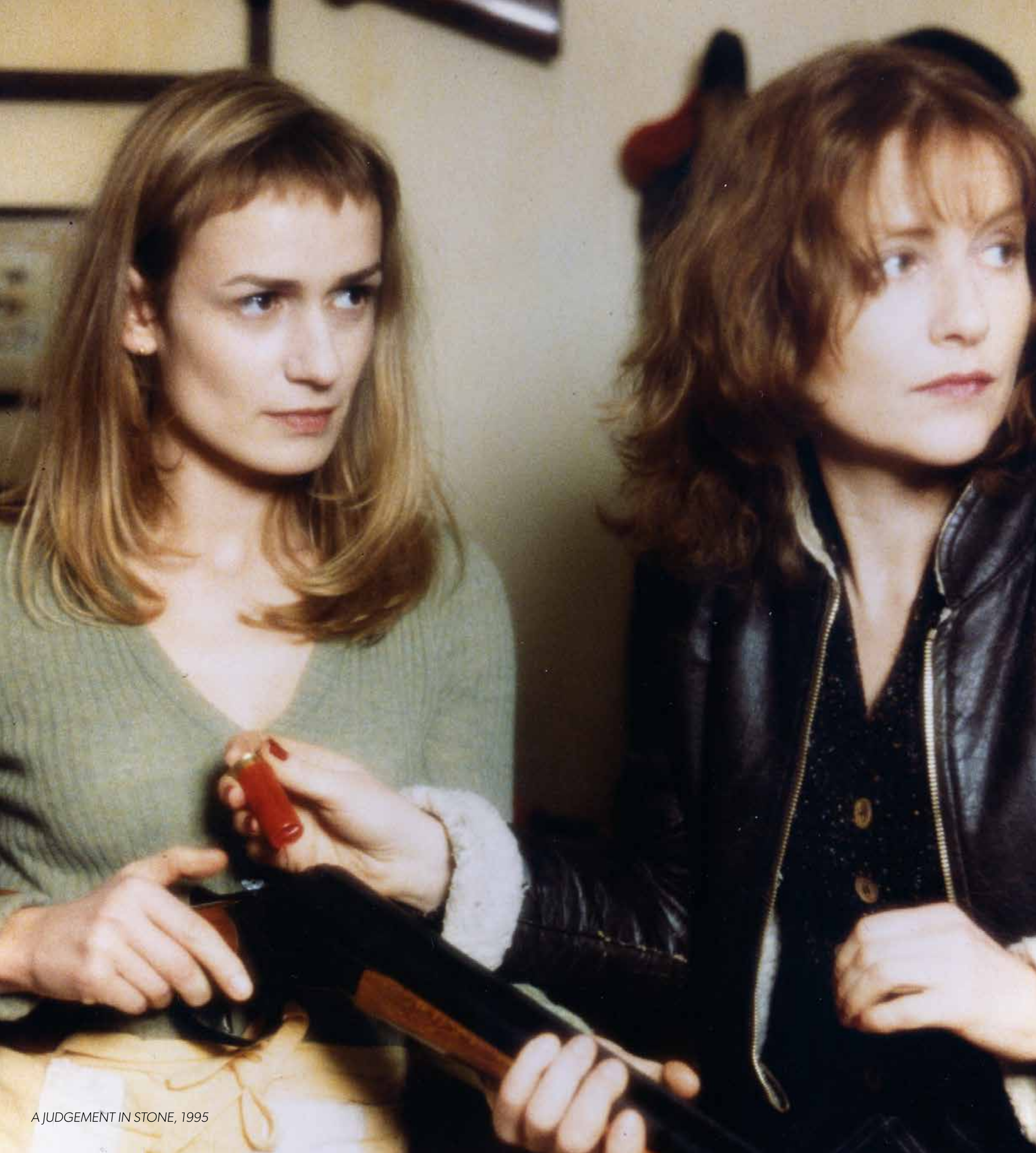
A JUDGEMENT IN STONE, 1995