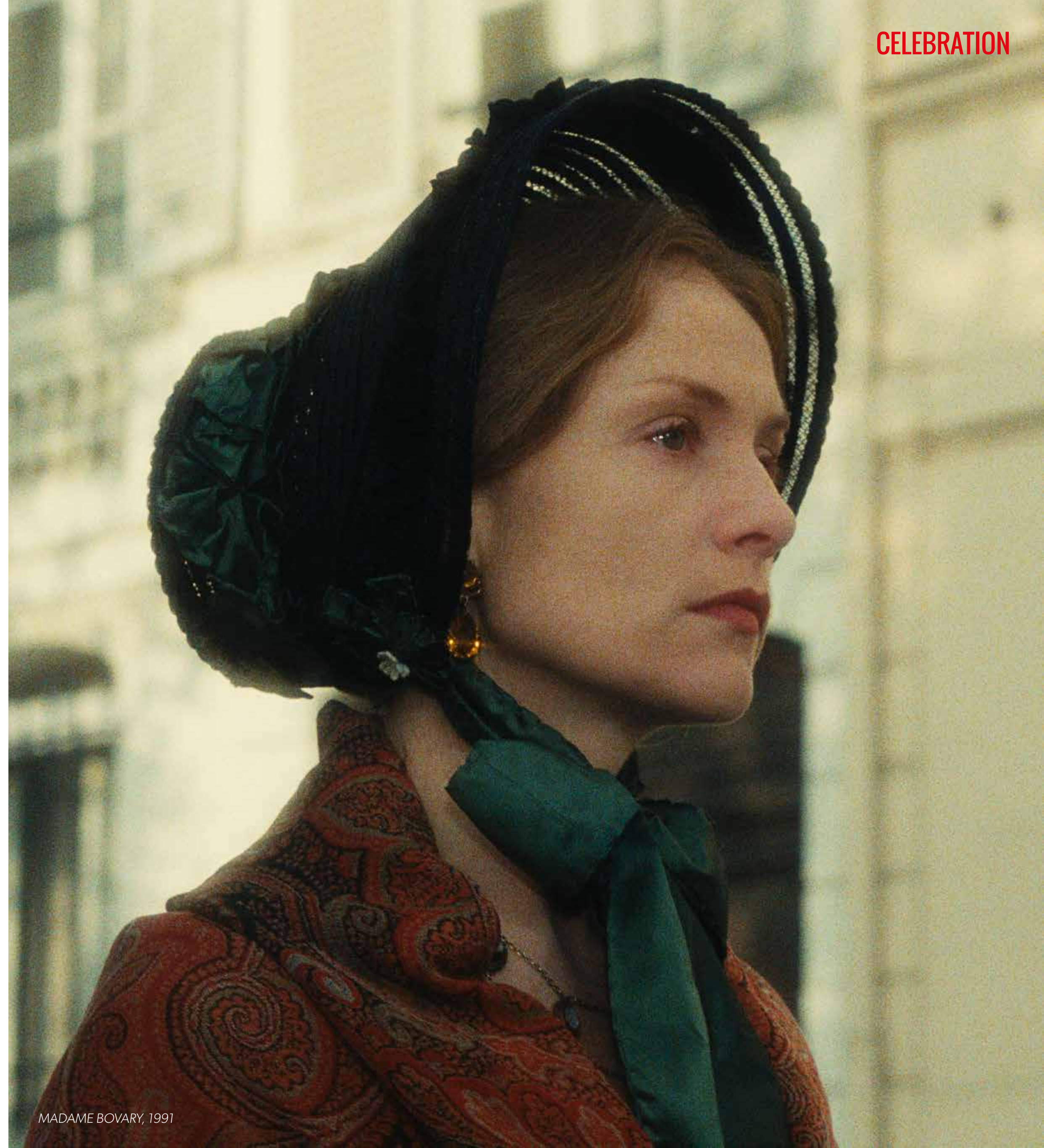
MADAME BOVARY, 1991