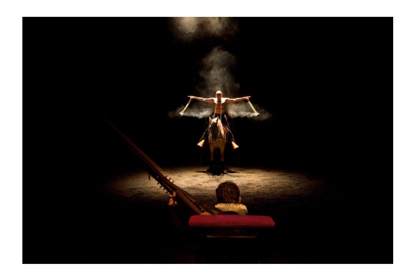
"Bartabas himself is a shamanistic presence ."