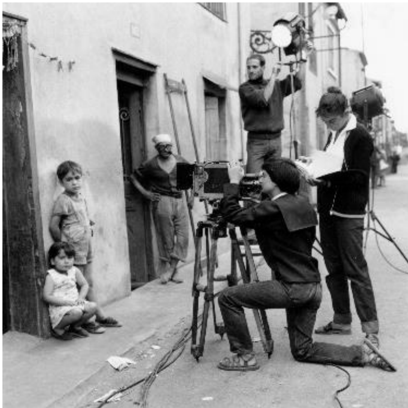
Agnès Varda on the set on the first day of her first film, LA POINTE COURTE, July 1954