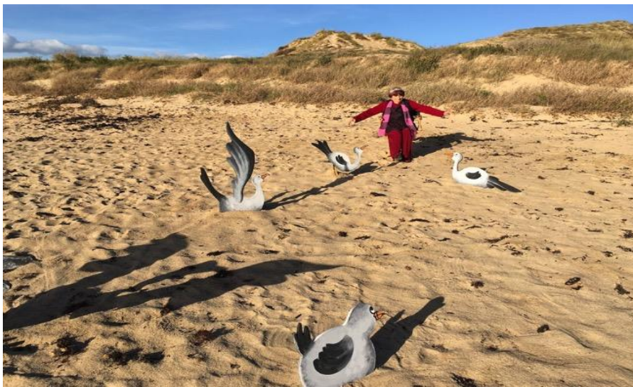
Agnès Varda on the set of VARDA BY AGNÈS , 2018