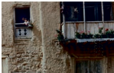
AND LIFE GOES ON