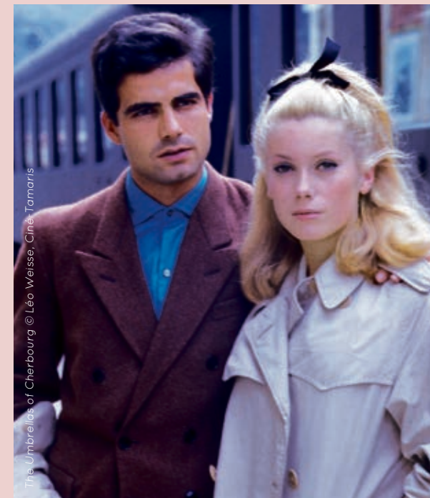
The Umbrellas of Cherbourg