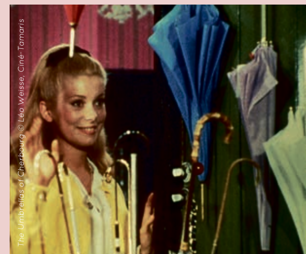
The Umbrellas of Cherbourg