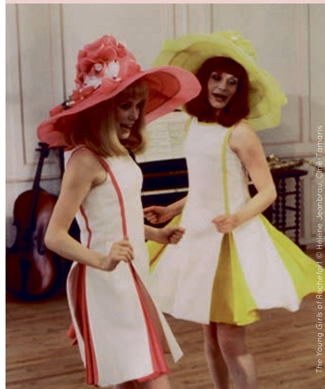
The Young Girls of Rochefort