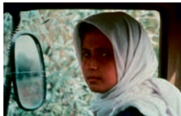
THROUGH THE OLIVE TREES