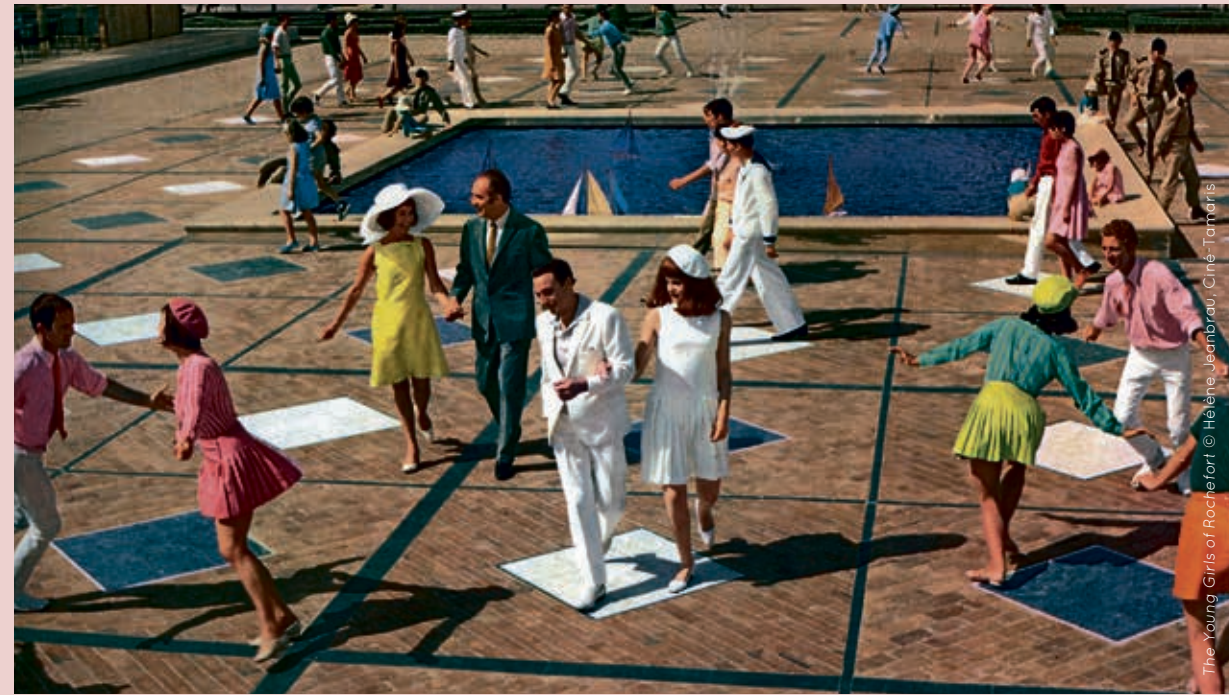
The Young Girls of Rochefort

Also available: the Fred Astaire & Ginger Rogers founding features, including TOP HAT (1935) by Mark Sandrich, THE GAY DEVORCEE (1934) by Pandro S. Berman, and many more RKO Pictures classics like HIGHER AND HIGHER (1943) by Tim Whelan, with Frank Sinatra and Michèle Morgan!