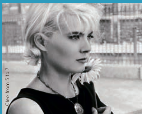
Cleo from 5 to 7