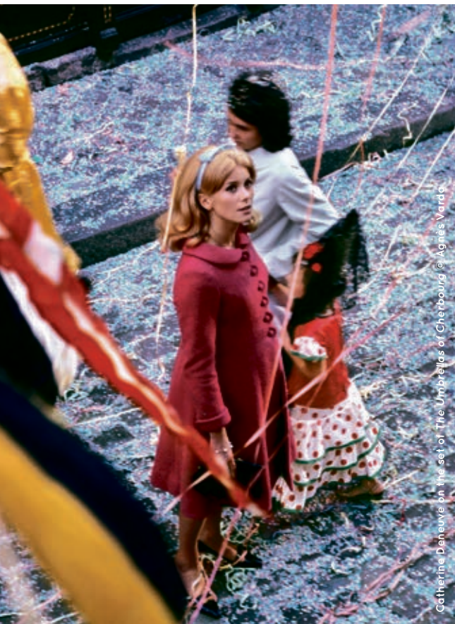
Catherine Deneuve on the set of 'The Umbrellas of Cherbourg' © Agnès Varda