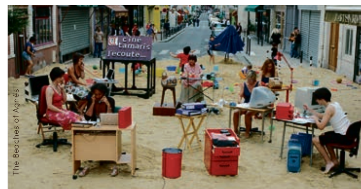
The Beaches of Agnès