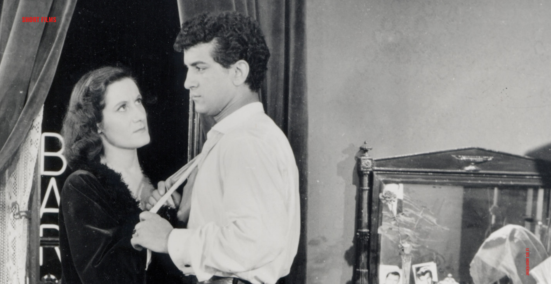
LE SABOTIER DU VAL DE LOIRE (1955, 23") LE BEL INDIFFÉRENT (1957, 29')